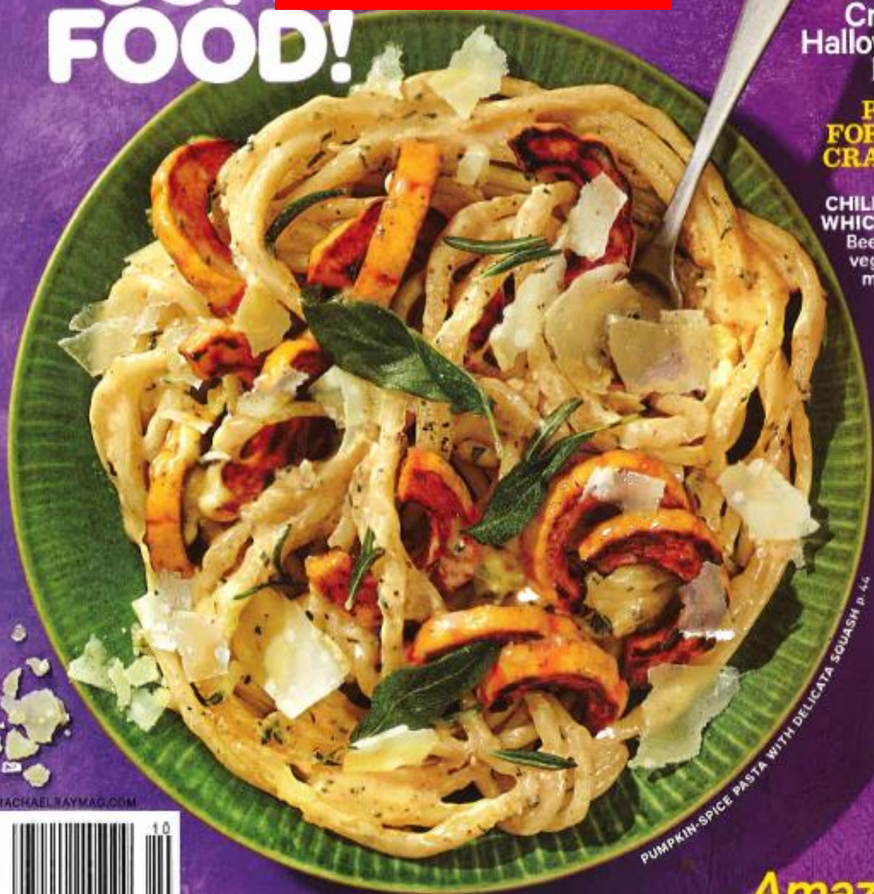
PUMPKIN-SPICE PASTA WITH DELICATA SQUASH p. 46

CHILI EVERY WHICH WAY! Beefy, spicy, vegetarian, more! p. 100